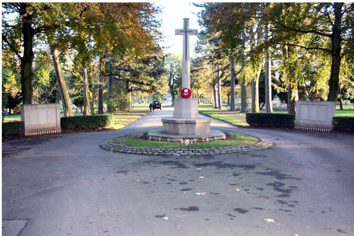
Cross of Sacrifice at Brandwood End Cemetery, Birmingham