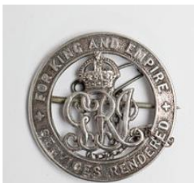
Silver War Badge